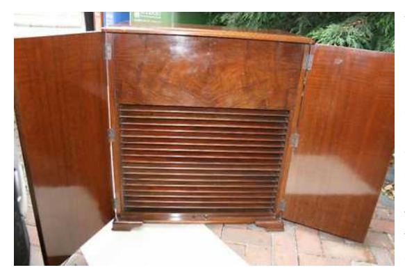
A20 tone cabinet. Boosey & Hawkes serial no 0017

There appears to be (in admittedly still very small numbers), comparatively, more BCs than ABs, and one can only conclude that once the BC became available, this was preferred for its second chorus generator despite the increased cost. A <u>Boosey & Hawkes price list</u> from April 1938, lists The Model BC (simply listed as Model B) at £390.00. This is placed above the Model AB (listed as Model A) which sold for £350.00. The emphasis on the Model B in the price list over the Model AB perhaps reflects the emphasis salesmen were giving at the time and explains why there are more Model BC remaining than Model AB today! The Model E was considerably more expensive at £550.00 and a Model F without chorus generator was £510.00