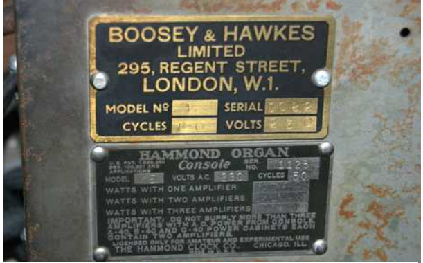
Model E carrying both Hammond and Boosey & Hawkes serial plates

below). This replacement of the original plates, makes dating using Hammond serial numbers impossible. I suspect the change to B&H plates happened sometime in late 1936 or early 1937. I have come across anecdotal evidence of a Model BC with a B&H plate (B&H 0071) allegedly purchased for a church in 1936, and a further one (B&H 0068) which was purchased by another church in September 1937. No original receipts were available in either case unfortunately.