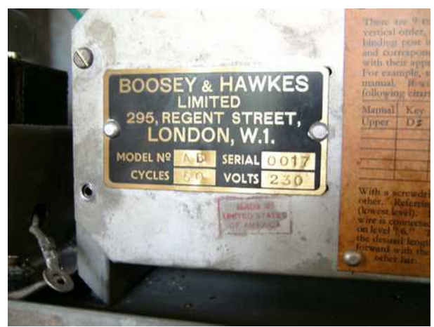
Model AB (above) showing two of the four original rivet holes from the Hammond serial plate underneath the Boosey & Hawkes serial plate

Critically the serial numbering system that B&H imposed on their plates, bore no relation to the Hammond serial number system. This is evidenced by a few rare UK Model E Organs that somehow retained both Hammond and B&H serial plates. There is also the occasional Model K or KE that carry both plates (more details on Model K's